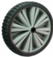
EX10786 Optiflex-lite puncture proof wheel 37cm

Look at our Featured Products section. All the newest Optiparts products.